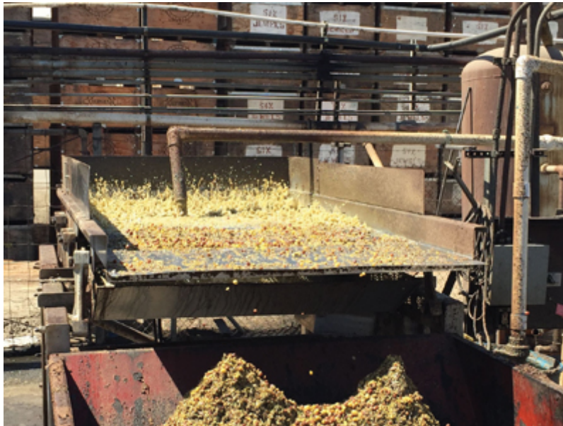
The food processing shaker bed.

The plant operators came to Del Rey with a request to lower Total Suspended Solids (TSS) and BOD in Del Rey's wastewater. The company tried everything from filter screens to a reverse osmosis (RO) system. Marginal improvements were made by implementing a food processing shaker bed with a 5-mm mesh to remove the coarse solids, followed by a rotary drum screen with a 250- \mu mesh to remove finer solids. But the drum screen did not provide the reductions in TSS that were needed. Beyond that, traditional automatic filters plugged up, and MF/UF/RO systems were orders of magnitude too expensive to operate.