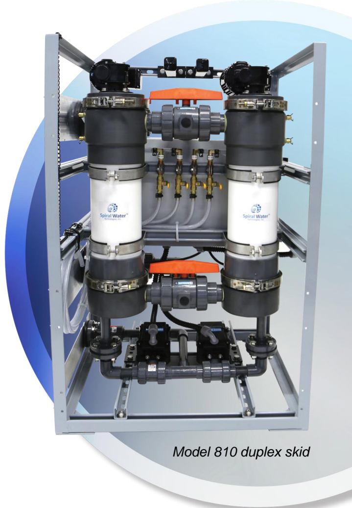
Model 810 duplex skid

Spiral Water's filtration experts installed two, 50 micron, Model 810 Filters operating at 65 gpm to function as pre-filters for the scrubber's fresh water feed.