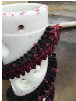
Spiral Water's unique action filters pomegranate solids, protects flavor