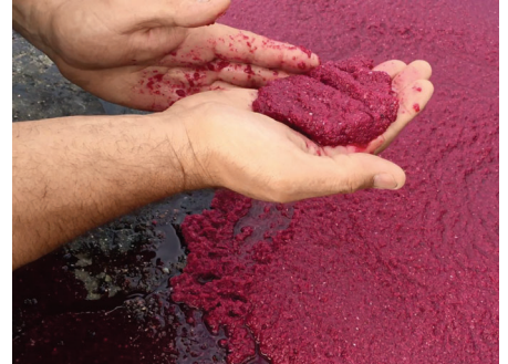
Collected solids ready to convert from "waste" to resale

Using the innovative filtration technology in Spiral Water's 810 filter, the pomegranate juice was filtered from 8% solids to 1% solids, reducing the amount of product lost from 400 gallons per batch (a 13% loss) to just 85 gallons (a 1.7% loss). Spiral Water's one-pass filtration uses built-in sensors to purge concentrated solids. In the case of the pomegranate juice, these concentrated solids – a former "waste product" – contain nutrients and texture that are of value in other industries, including agriculture and cosmetics. The grower/producer is extremely satisfied with the results, reporting that Spiral Water achieved all his objectives for product flavor and clarity.