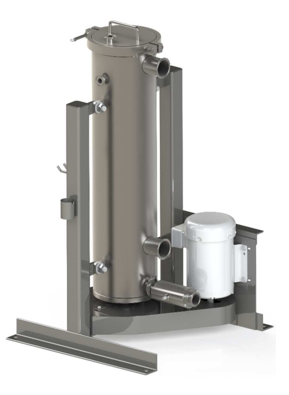
Figure 3. Spiral Water Model S1000 Filter Unit