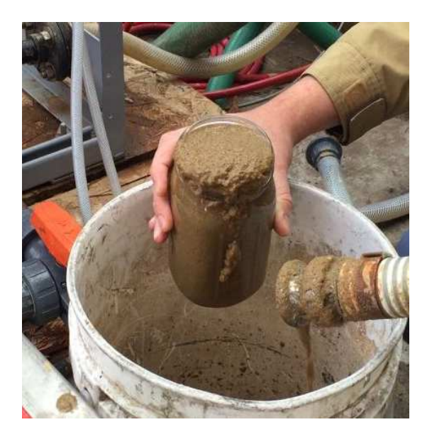
Figure 4. Collected Solids from brewery wastewater.

The TSS measurement is often overlooked because wastewater system operators typically monitor only total Chemical Oxygen Demand (COD) and not TSS. COD is measured because it provides a good baseline for gauging bioreactor performance and it can be measured in real-time. But COD measurements do not differentiate between soluble COD, which bioreactors like, and insoluble COD, which bioreactors do not like. It is the insoluble COD, which correlates with TSS and which causes problems for bioreactor